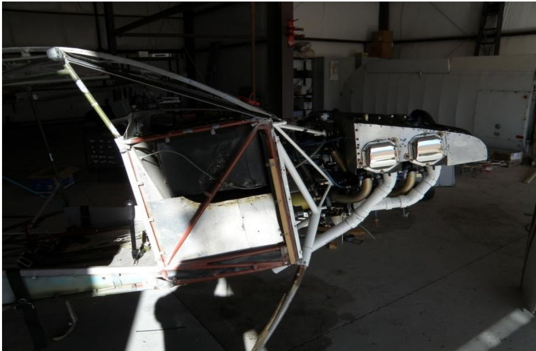
Cory has mocked up the exhaust with PVC in order to get the shape and curves to fit under the tight Cowl. His next step is to build the exhaust out of steel pipe